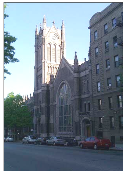
NORTH Church in Manhattan